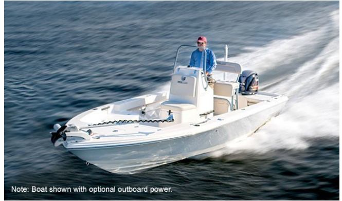
Note: Boat shown with optional outboard power.

The information and data contained in this Performance Bulletin is approximate and subject to many different factors and variables. It is provided as a guideline only and should not be relied upon as representative of actual performance. Your boat's performance may be different than the information contained in this Performance Bulletin due to various factors, including your boat's actual weight, wind and water conditions, temperature, humidity, elevation, bottom paint, boat options affecting wind/water drag and/or boat weight, and operator ability. Please confirm the specifications and performance data on your specific boat/engine combination with your dealer prior to purchase. Please also keep in mind that the data contained in this Performance Bulletin may or may not have been performed using Yamaha PowerMatched components. Yamaha reserves the right to change the specifications and performance data of this Performance Bulletin or engine without notice. This document contains many of Yamaha's valuable trademarks. It may also contain trademarks belonging to other companies. Any references to other companies or their products are for identification purposes only, and are not intended to be an endorsement.